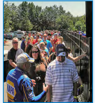
Raceworld USA Fan Day

Visit Lake Norman reved up its exposure throughout race week. Visit Lake Norman participated in Raceworld USA Fan Appreciation Day and Joe Gibbs Racing's Fan Fest by setting up a booth with information regarding the Towns of Cornelius, Davidson, and Huntersville. Prizes and giveaways of Lake Norman paraphenelia was also given away.