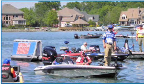
Walmart FLW National Guard Open