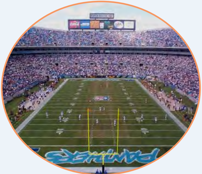
Bank of America Stadium

419,860 People would fill the Panthers Stadium 5 Times!