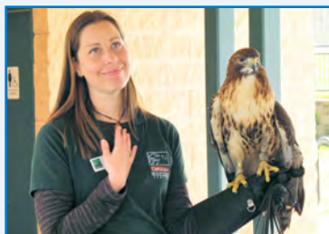
Carolina Raptor Center