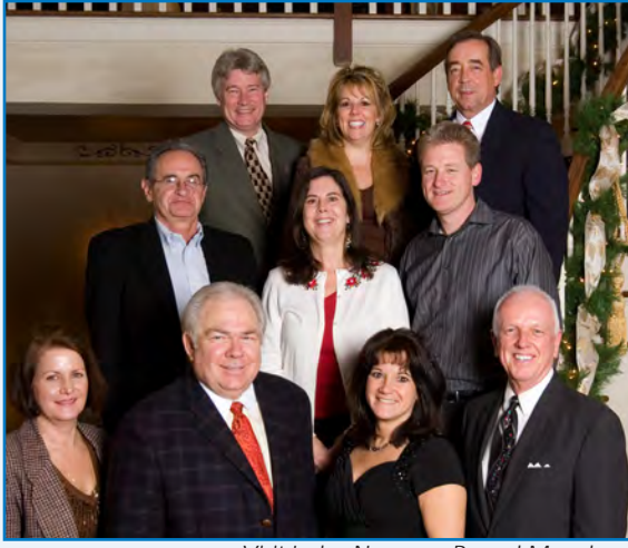
Visit Lake Norman Board Members