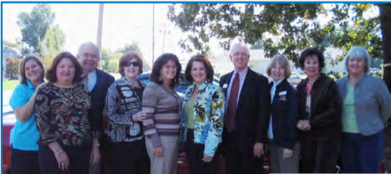
Ambassadors, Board Members, and Staff