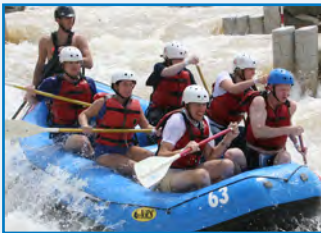
Interns and Staff take on the US Whitewater Challenge