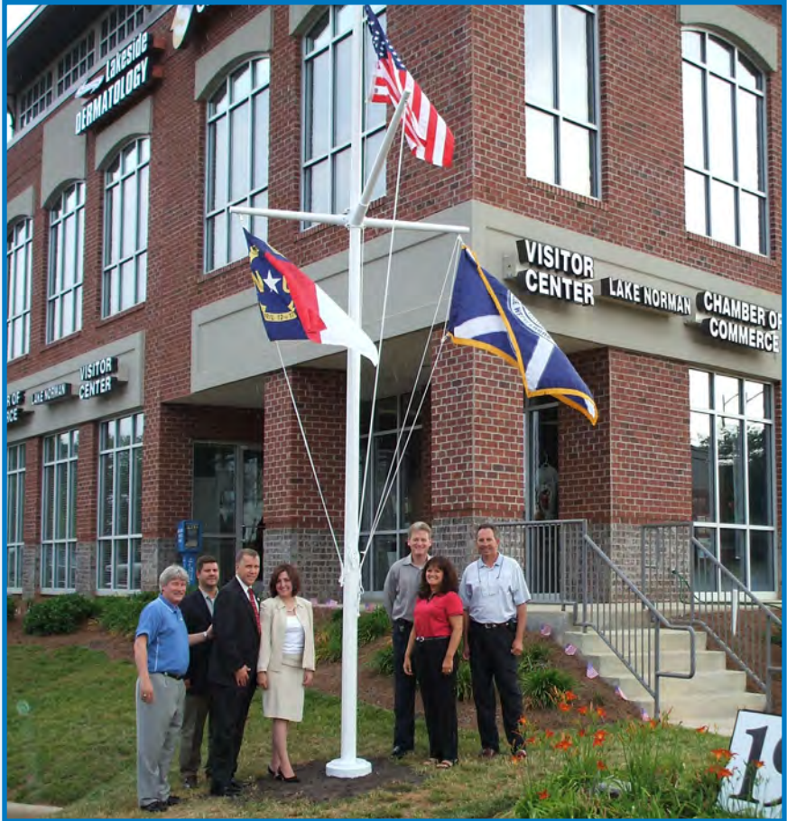
Visitor Center Flag Pole Dedication

Visit Lake Norman 19900 West Catawba Avenue Cornelius, North Carolina 28031