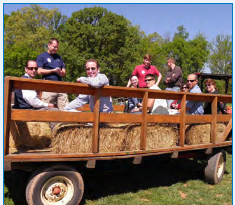
Leadership Class at the Bradford Store

Visit Lake Norman annually hosts the Lake Norman Chamber of Commerce Leadership Class educating community leaders on tourism-related and meeting-related activities in our towns. Tours feature the economic impact of tourism to the community and the vital role that Visit Lake Norman plays in bringing tourism dollars and tax revenue into the Lake Norman community. Many positive business relationships develop from this outreach, strengthening our community connections with local government, financial institutions, banking, non-profit organizations, and hospitality partners.