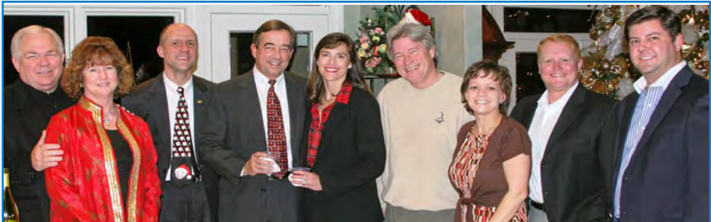
Visit Lake Norman Leaders