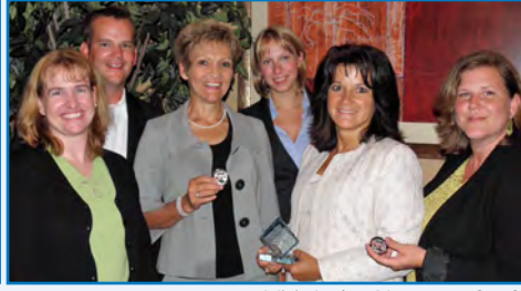
Visit Lake Norman Staff