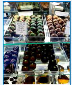
Davidson Chocolate Co.

Partnered with Davidson's merchant whom created unique chocolate bass fish as giveaways for events, trade shows, and fishing tournaments.